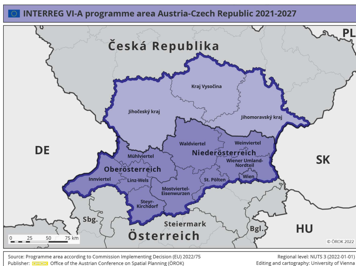
Figure 1: Programme area Interreg Austria – Czechia 2021-2027

Source: https://www.at-cz.eu/at/programm/programmgebiet